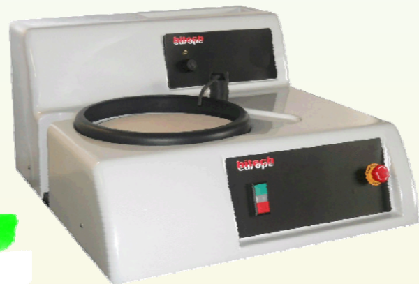
MP 311 (code 02-30-311F-A)