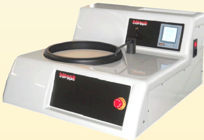
MP 311/T (code 02-30-311T-A)