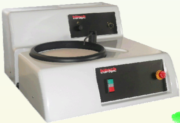
MP 311/V (code 02-30-311V-A)